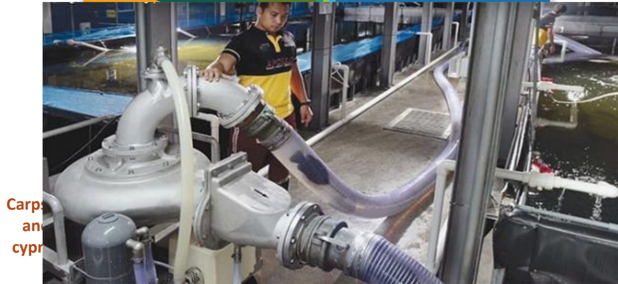
Carps and cyprinids